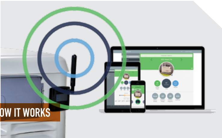
HOW IT WORKS